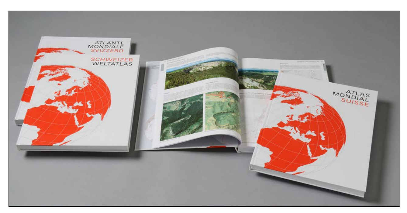
Figure 1. The Swiss World Atlas 2017 in three language versions. The open double page of the introduction chapter shows a comparison between reality and map models.

This contribution presents the concept and implementation of a new, coherent, and innovative introduction chapter for the 2017 edition of the printed Swiss World Atlas (Figure 1). A comparison to similar chapters of other widely used school atlas examples from Europe and North America serves to evaluate the didactical value of this introductory part of the Swiss World Atlas.